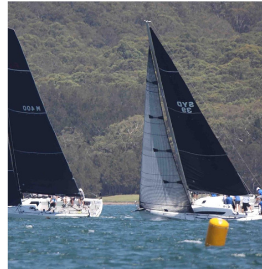
Saturday 11 February