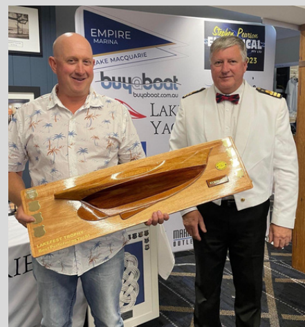
LakeFest Best Performed Boat 'Roadrunner'

More Photos on Lake Macquarie Yacht Club Facebook page