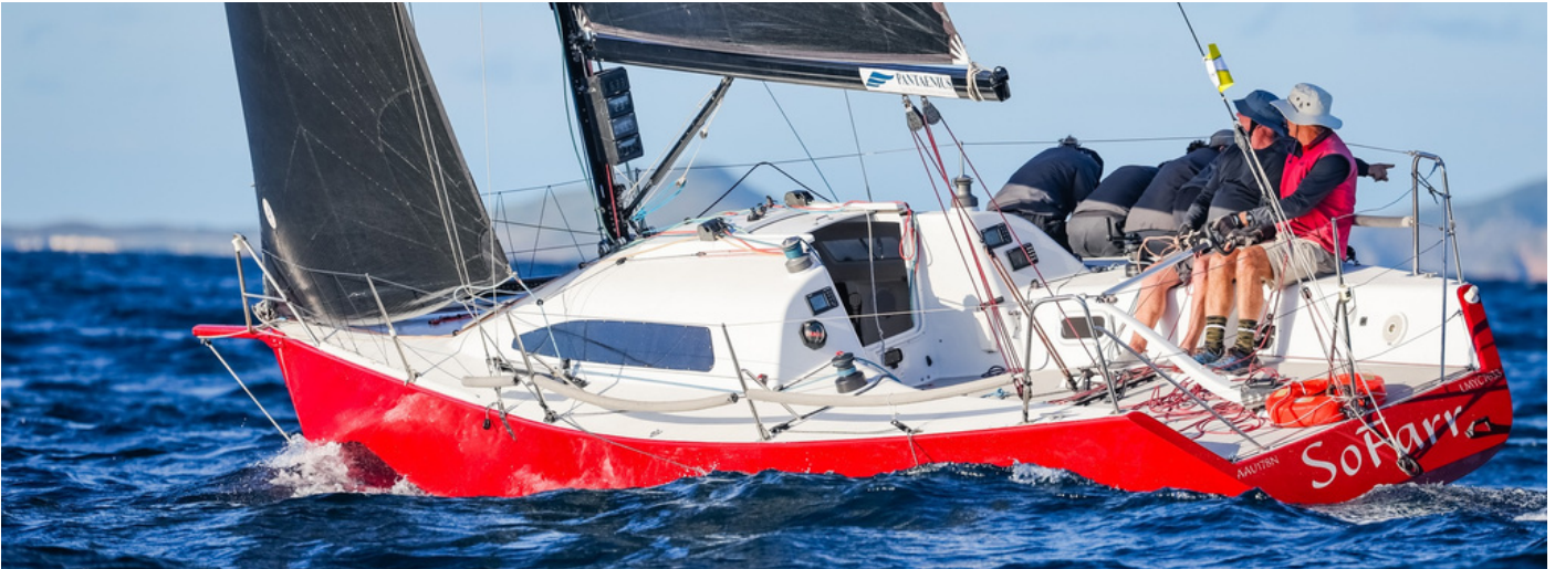
Winners IRC Division 3 winner, Sail Port Stephens

Newsletter from Lake Macquarie Yacht Club