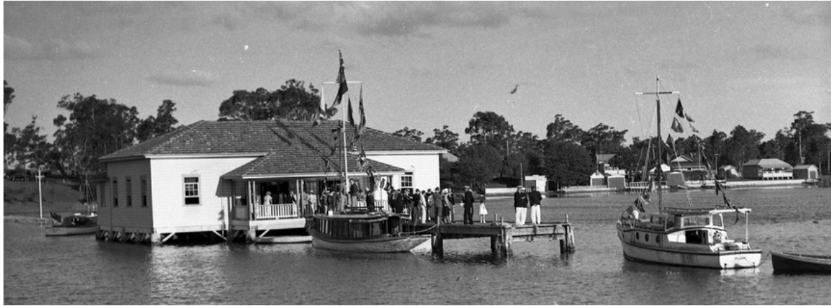
LMYC Open Day October 19 1935.

Newsletter from Lake Macquarie Yacht Club