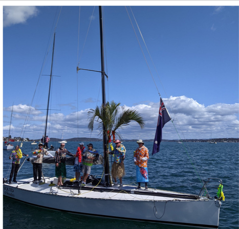
Squid4Woodsy - Best dressed crew