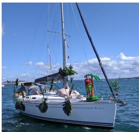
Papalana - Highly Commended