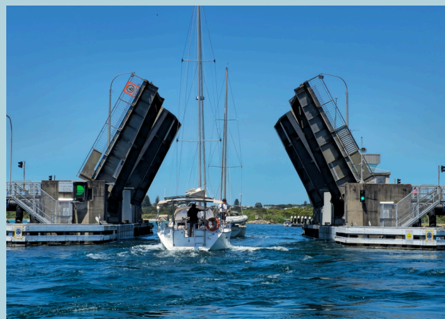
Crews heading through the Swansea Channel Bridge