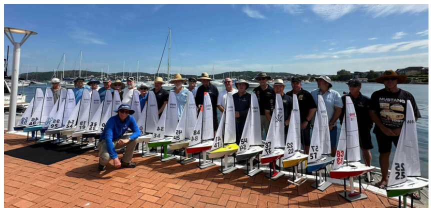
Twenty entrants from LMYC, Victoria, and New Zealand