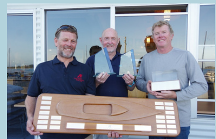
L to R: