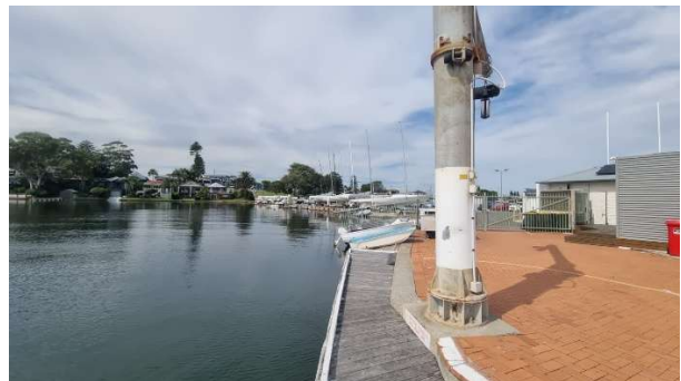
Trailer Parking and Crane